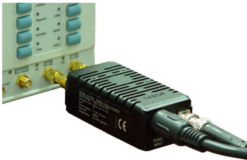
Figure 2, Connecting the A10160 to Tabor WX or WS8351/2 unit

There is no switch control to turn A10160 amplification on and off and therefore, the amplifier is active immediately after you power it up. Always make sure your load is protected from inadvertent power up conditions before you turn on your A10160.