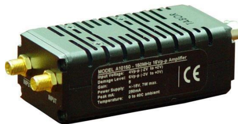
Figure 1, Model A10160