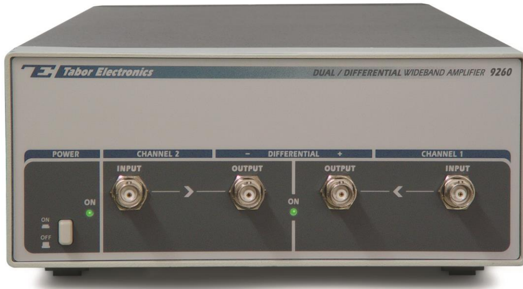
Figure 1-1, The Model 9260