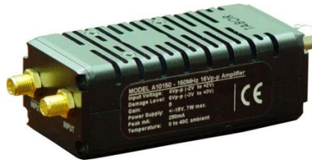
Figure 1.1 Model A10150