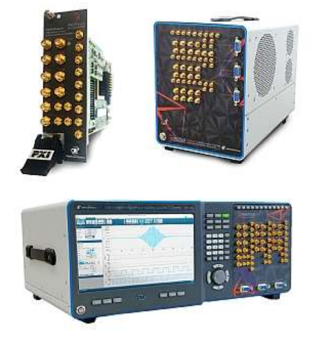
Figure 3: The Tabor Proteus Family

Tabor's Proteus series goes beyond Arbitrary Waveform Generation, as the world's first Arbitrary Waveform Transceiver . The system integrates the ability to transmit, receive and perform digital signal processing all in a single instrument.